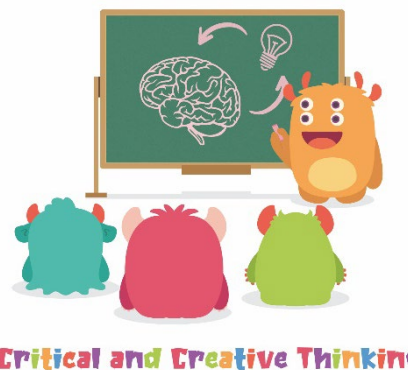
Critical and Creative Thinking

I share, contribute and listen when working with others.