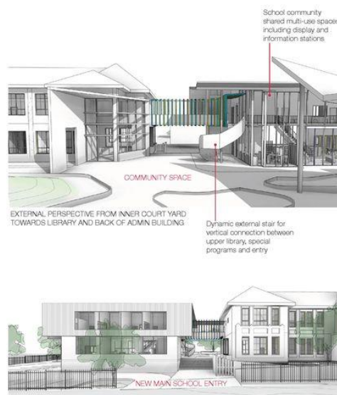
EXTERNAL PERSPECTIVE VIEW OF RAINBOW STREET MAIN ENTRY