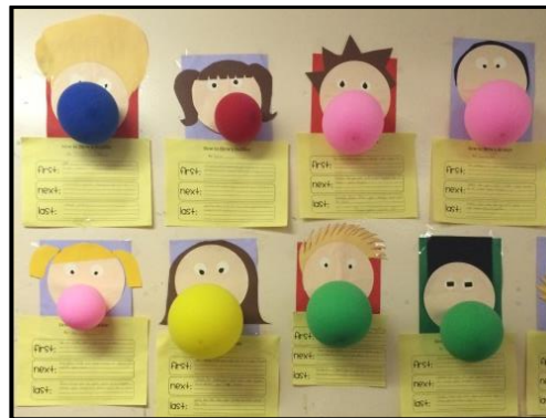
3/4P - How To Blow A Bubble.