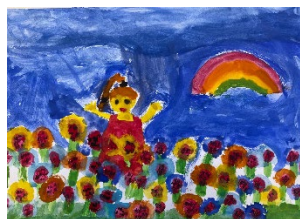
Spring by Greta