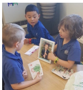
My Preschool Graduation - Exploring why we need to look after the environment