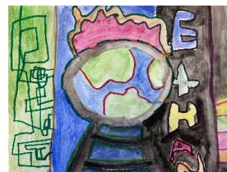
Summer by Ethan