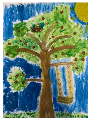
Spring by Lexi