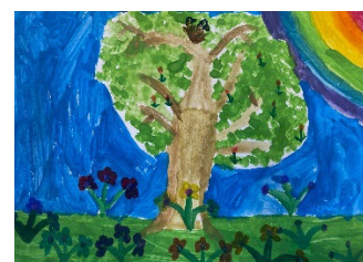
Spring by Amelie