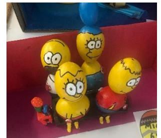
Some of last year's entries

Please note that students must decorate blown eggs at home and then bring them to the school Library between 8:30am and 8:55am on Monday 6 April 2020. The winners will be announced on Wednesday 8 April 2019.