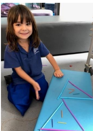
Discovering 2D shapes