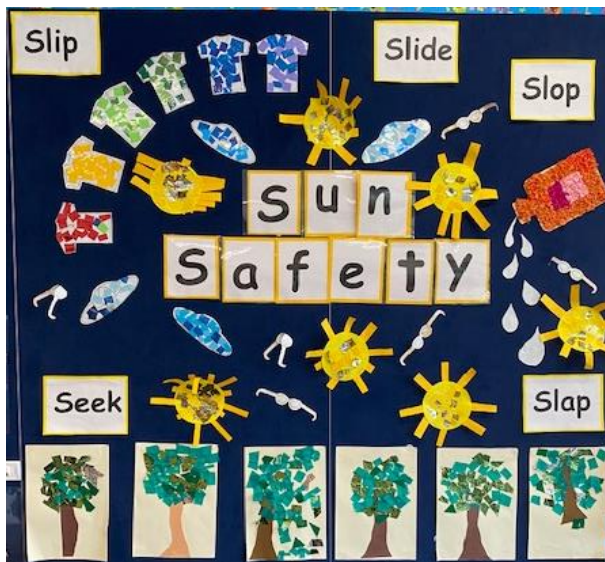
Staying safe in the sun