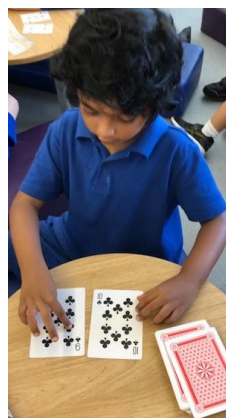
Using cards to practice addition