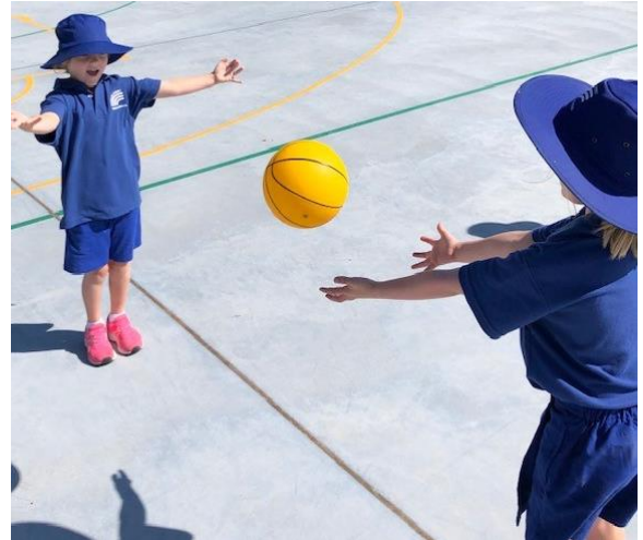
Hands ready! Throwing and catching