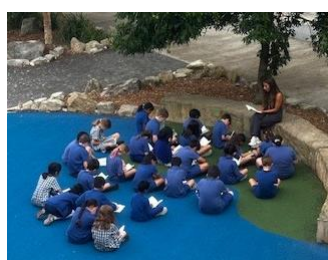
Class reading in an outdoor space