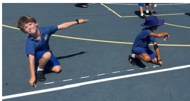
How long is the basketball court? Let's estimate and investigate.