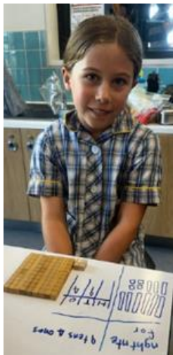
Representing numbers in different ways