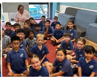
Listening to a story being read