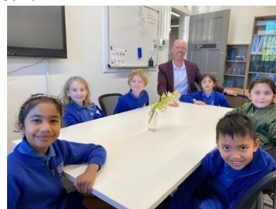
1/2T students sharing their writing with Principal.

We look forward to an engaging and productive Term 3 with new opportunities for learning and a number of exciting events planned. It's going to be a busy term! Thank you for your ongoing support and commitment to our school community. Enjoy the upcoming school holiday break!