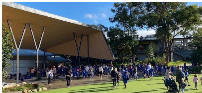
The sun came out to cap off another successful Mother's Day Breakfast.

Our Term 2 learning programs are up and running and it has been wonderful to see the students engaging with learning as I walk around the school. Stage Newsletters have been distributed outlining the learning programs in more detail. A focus for the school this term will be for teachers to meet in teams to review assessment data and use this to plan next steps. Later this term, Semester 1 reports will be published to the School Bytes parent portal. You will notice a change to this year's reports. These changes are a result of new guidelines provided by the Department of Education. If at any time you wish to