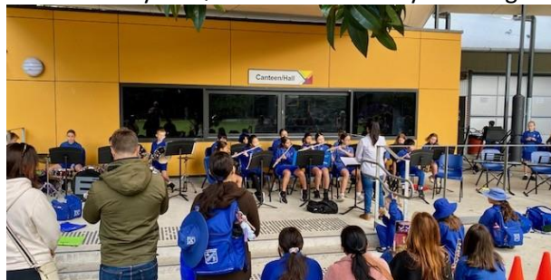
School band performance at the Mother's Day BBQ

We have had a big week of events this week at school starting with the election day BBQ on Saturday. A mammoth effort from the organising parents starting at 6:15am and finishing after 5pm! Collectively we raised around $4,000 from the democracy sausage BBQ, cake stall and sale of tea towels. An amazing achievement, and once again I would like to acknowledge and thank the parents who volunteered on the day or put work behind the scenes to organise the event. This extends to those assisting with the Mother's Day BBQ Breakfast on Friday morning.